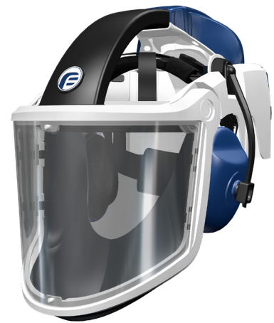
Shown Above: Skeletal Frame with Clear Visor/Faceseal and Ear Protection.