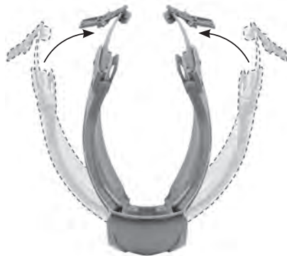
Collapses for Easy Storage