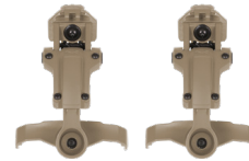
(2) Rail Mount Arms