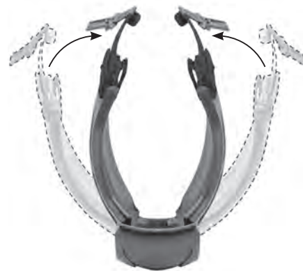
Folds for Easy Storage