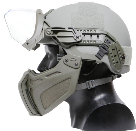
(Continued on back)