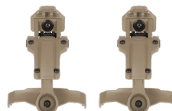
(2) Rail mount arms