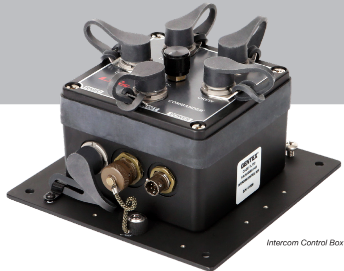
Intercom Control Box