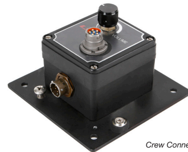
Crew Connection Point

PTT keying schemes and radio transmit and receive levels can be adjusted during installation while an optional radio switch box can be used for radio transmit selection. Radio access can also be configured independently for each crewmember to enable or disable transmit, and receive capabilities over a connected radio system. The commander radio transmit priority override function allows the commander to interrupt transmissions from other crewmembers.