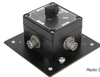
Radio Switch Box