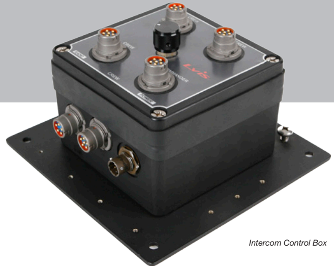
Intercom Control Box