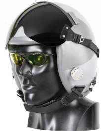
Gentex Jag Self Protect LEP spectacle paired with a Gentex HGU-55/P helmet