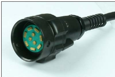
U-77 Connector End