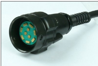
U-77 Connector End