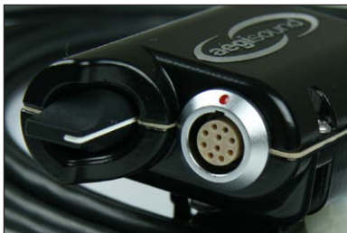
F-35 Intercom Adapter Box