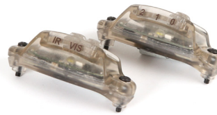
CORE Survival® Strobes