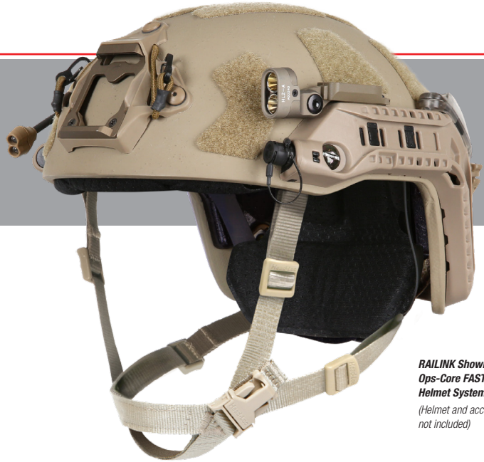
RAILINK Shown on Ops-Core FAST® SF Helmet System (Helmet and accessories not included)