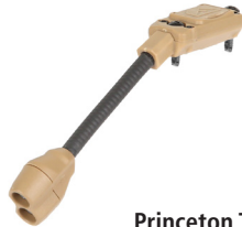
Princeton Tech® Flexlight